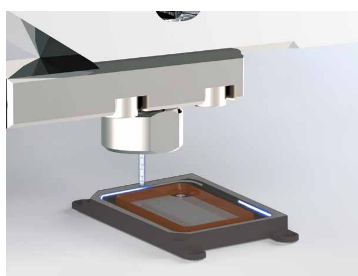
Vibrating membrane attach on speaker