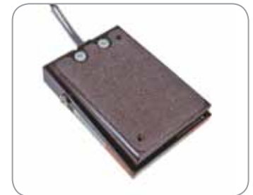
Optional hands free foot pedal.