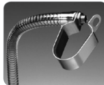
Optional hands free Gooseneck mounting stand.

The AirForce is lightweight, flexible and easy-to-use. With strong blow-off power the AirForce is effective in removing particle contamination.